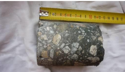
Figure 3: Concrete coring campaign.

The job specification for concrete coring of GBS and mooring dolphins covers the following aspects: