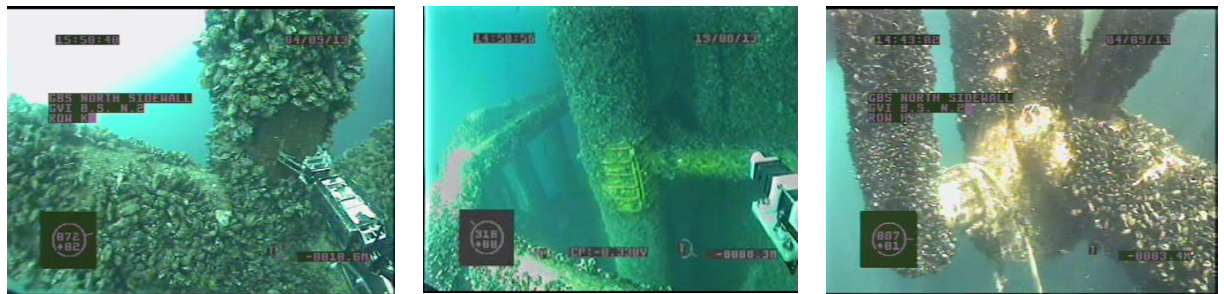
Figure 5: Underwater close visual inspection of mechanical outfitting.

Personnel with recognized certification and technical background in cathodic protection were also deployed for the coordination and the supervision of the offshore inspection campaigns. In addition to the Company representative role, the supervision of the inspection campaign also had the possibility to verify the accurate execution of the inspection and the compliance with all the requirements set into the job specifications.