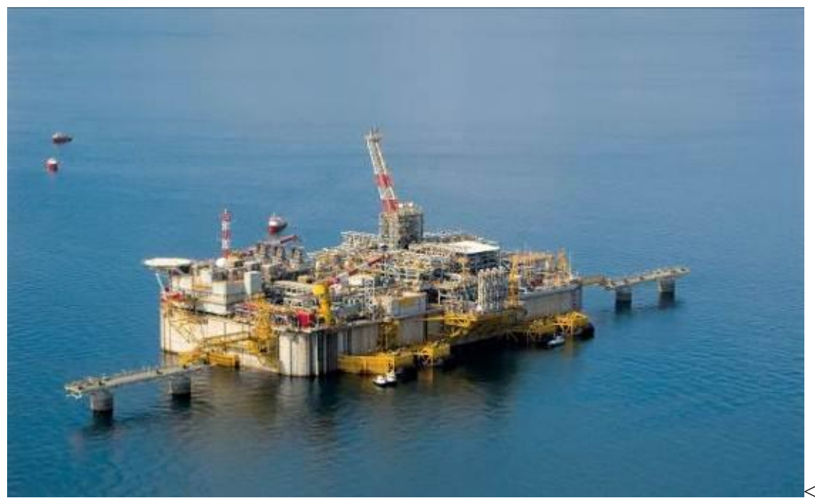
Figure 1: The Adriatic LNG Terminal.

The GBS contains two LNG storage tanks with a total working capacity of 250,000 cubic meters, approximately twice the capacity of a conventional LNG carrier. Major process equipment includes four loading arms, four in-tank LNG pumps, five high-pressure send-out pumps, four Open Rack Vaporizers (ORV's) which use seawater as the heating medium, a Waste Heat Recovery LNG Vaporizer (WHRV) which uses waste heat from the turbine generators, and two Boil-Off Gas (BOG) compressors.